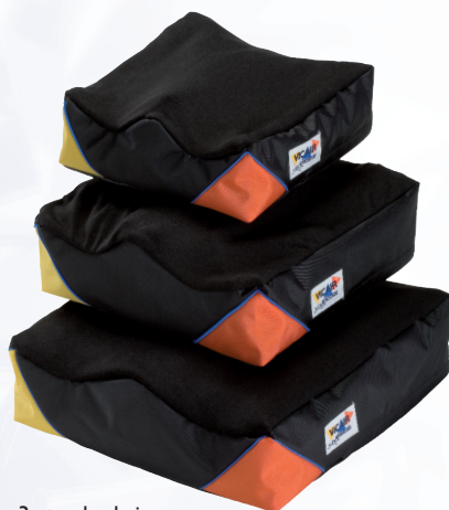
3 standard sizes

The top fabric of both covers is stretchable in two directions, guaranteeing optimal immersion of the body into the cushion. The Comfair cover has a breathable top fabric for comfort and moisture dispersal. The Incontinence cover is made of a vapour permeable, waterproof material.