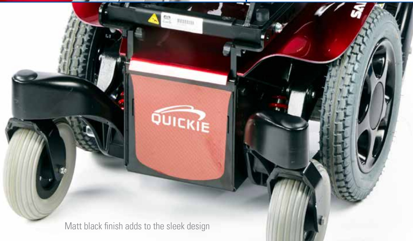
Matt black finish adds to the sleek design

Choose from a selection of four stylish shrouds