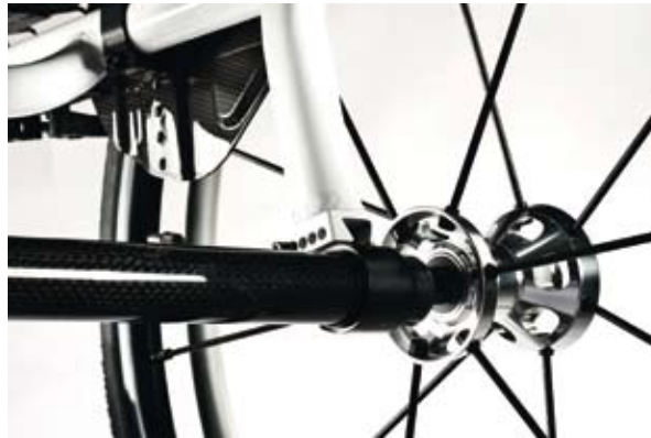
NEW carbon fibre axle tube Less weight, superb looks.