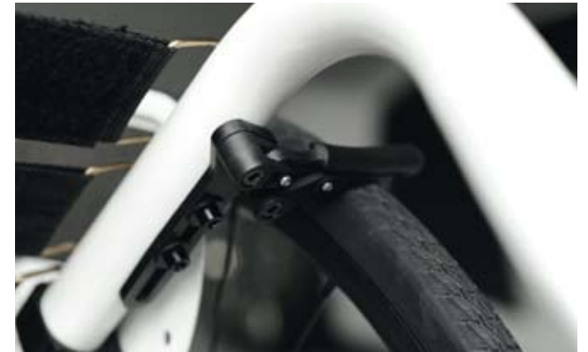
NEW lightweight compact wheel lock Improved design offers a lightweight, yet strong solution.