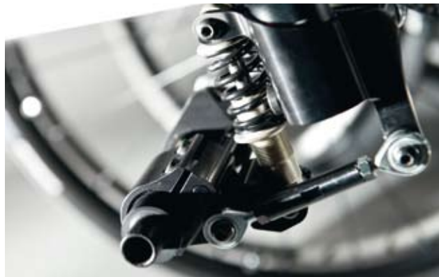
NEW suspension Sporty and lightweight suspension for a comfortable ride.