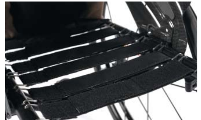
NEW clip style air flow seat upholstery Offers adjustable seating and increased rigidity for improved comfort and postural support.