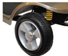
Puncture Proof Wheels