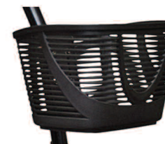
Front Storage Basket