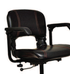
Swivel Comfort Seat