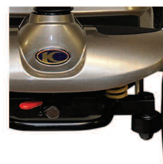
Safety Tiller Lock