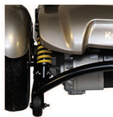
Front & Rear Suspension